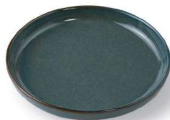
Plate 2436 - Ø17 x H2.5 cm