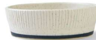
Bowl 2943 - Ø12 x H4 cm 200 ml