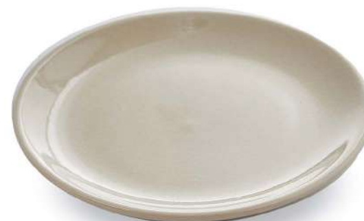
Plate 129 - Ø26 x H3 cm 005 - Ø21 x H2 cm 006 - Ø16.5 x H2 cm