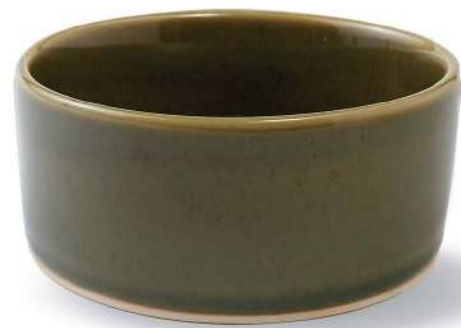
Jar 2628 - Ø12 x H5 cm 350 ml