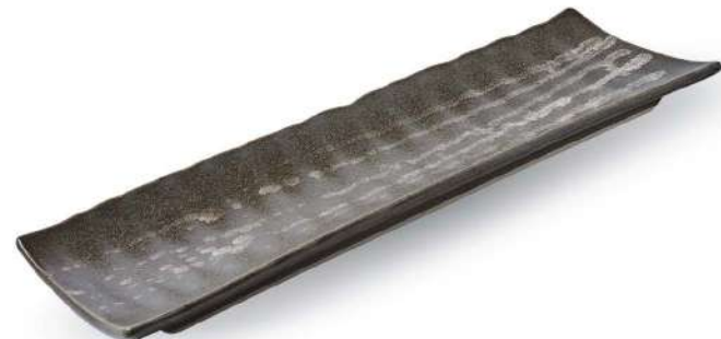
Rectangular Plate 2202 - 14.5 x 42.5 x 3 cm