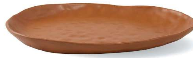
Oval Plate 2922 - 18.5 x 25 x 2.5 cm