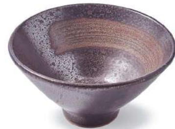
Conical Bowl 534 - Ø16 x H8.5 cm 450 ml 535 - Ø14cm x H7.5 cm 350 ml