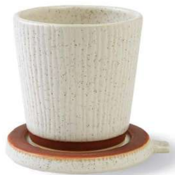
Tea Cup 2950 - Ø9 x H9 cm 250 ml Saucer w handle 2964 - Ø10 x H1.5 cm