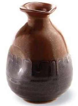
Sake Bottle 1859 - Ø9 x H12.5 cm 300 ml 1860 - Ø7 x H9.5 cm 150 ml