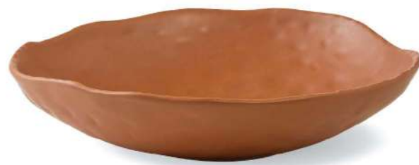
Bowl 2472 - 19.5 x 22 x 5 cm 500 ml