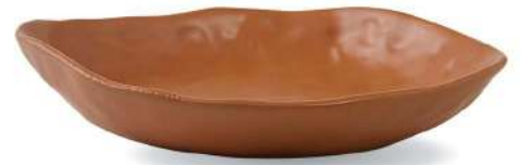
Deep Plate 2916 - 16.5 x 18 x 2 cm 275 ml