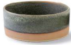
Jar 2628 - Ø12 x H5 cm 350 ml