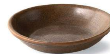
Bowl 029 - Ø14 x H3.5 cm 200 ml