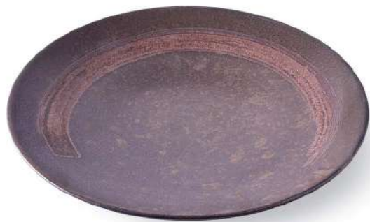
Plate 2570 - Ø30.5 x H3 cm 2476 - Ø27 x H3 cm 2477 - Ø23 x H3 cm 2478 - Ø16 x H2 cm