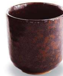
Tea Cup 722 - Ø7 x H7.5 cm 180 ml