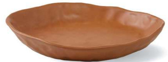
Deep Plate 2851 - 18 x 20 x 3 cm 400 ml