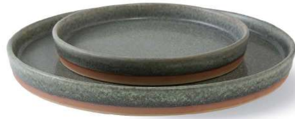
Plate 2732 - Ø17.5 x H3 cm 2751 - Ø25.5 x H3 cm