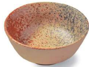
Bowl 1873 - Ø12 x H5.5 cm 300 ml