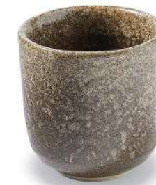
Tea Cup 722 - Ø7 x H7.5 cm 180 ml