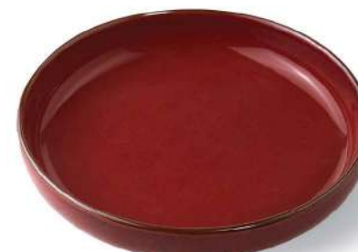
Plate 2420 - Ø20 x H4 cm 700 ml