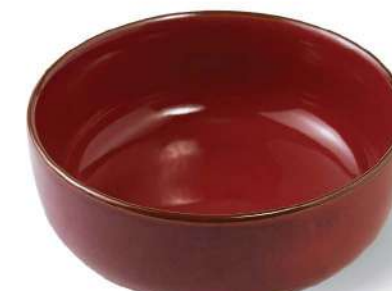
Bowl 2435 - Ø17 x H6 cm 900 ml