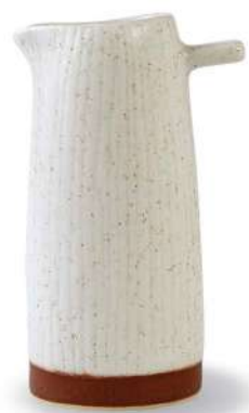
Jug 2944 - Ø5.5 x H11.5 cm 150 ml