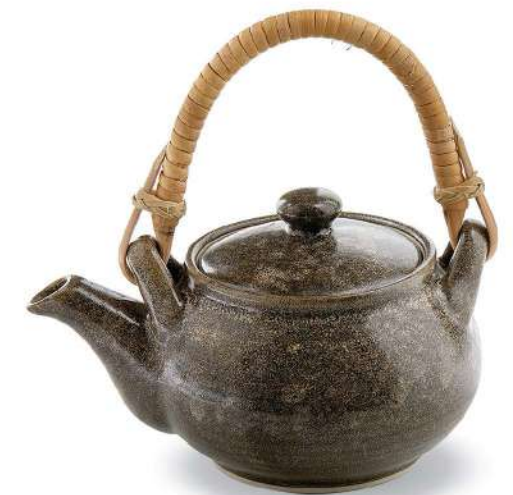
Tea Pot 623 - Ø13.5 x H11.5 cm 750ml