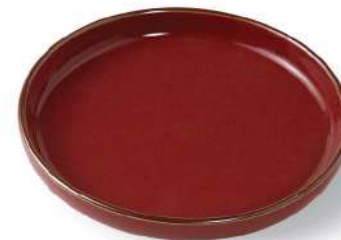
Plate 2436 - Ø17 x H2.5 cm