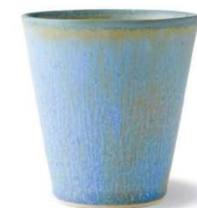
Conical Bowl 1944 - Ø7.5 x H8 cm 150 ml

Caribbean speaks of everything fresh and wholesome - from the sea, from the farm, from the market ... to your table.