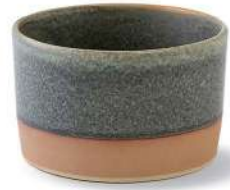
Jar 2625 - Ø12 x H7.5 cm 570 ml