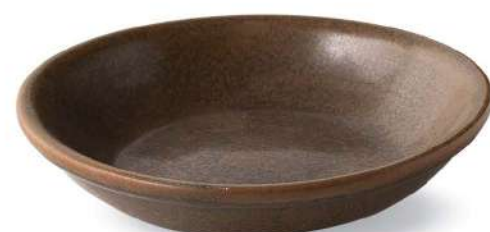
Bowl 027 - Ø23 x H4 cm 900 ml