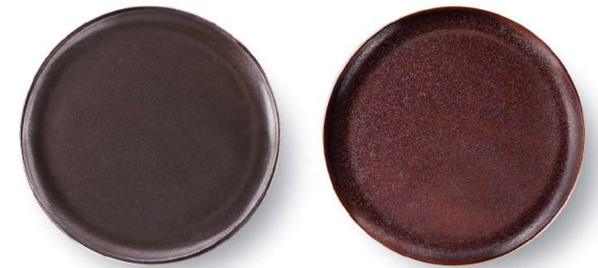
Plate 2881 - Ø26 x H1.5 cm