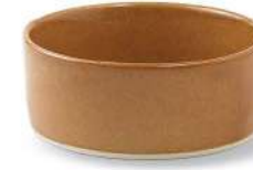
Jar 2628 - Ø12 x H5 cm 350 ml