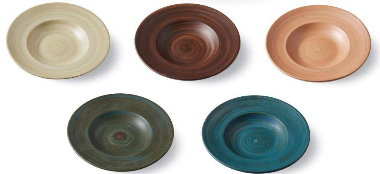
Bowl 2397 - Ø27 x H4.5 cm 375 ml