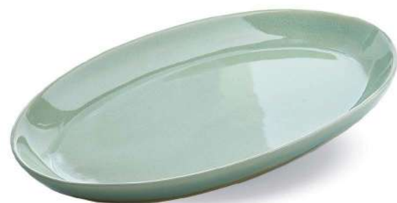
Oval Plate 153 - 22 x 35 x 3.5 cm 154 - 18 x 28 x 3.3 cm