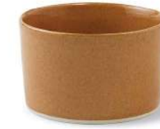
Jar 2625 - Ø12 x H7.5 cm 570 ml