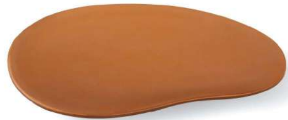
Flat Plate 2959 - 16.5 x 23.5 x 1.5 cm