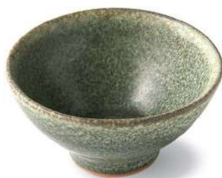
Bowl 349 - Ø15 x H7.5 cm 600 ml