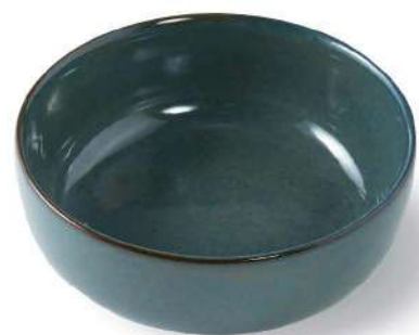
Bowl 2435 - Ø17 x H6 cm 900 ml