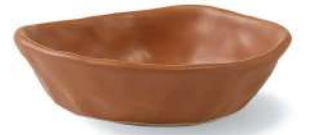
Sauce Dish 2918 - 8 x 9 x 2.5 cm 50 ml