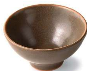
Bowl 352 - Ø12.5 x H6.5 cm 350 ml