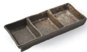
Condiment Set 1369 - 20 x 9 x 3 cm