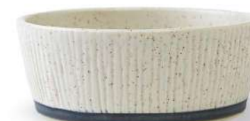
Bowl 2942 - Ø17.5 x H5 cm 600 ml