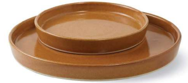
Plate 2732 - Ø17.5 x H3 cm 2751 - Ø25.5 x H3 cm