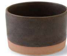
Jar 2625 - Ø12 x H7.5 cm 570 ml