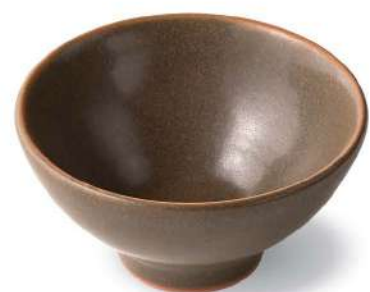
Bowl 346 - Ø18 x H8 cm 850 ml