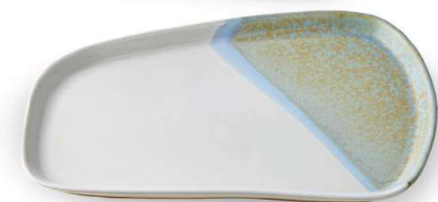
Rectangular Plate 2688 - 18 x 28 x 2 cm 2689 - 14 x 21.5 x 2 cm