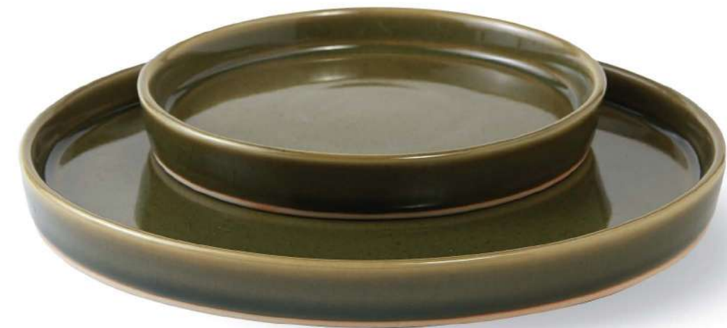
Plate 2732 - Ø17.5 x H3 cm 2751 - Ø25.5 x H3 cm