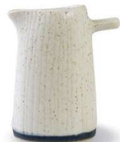
Jug 2945 - Ø5.5 x H8.5 cm 100 ml