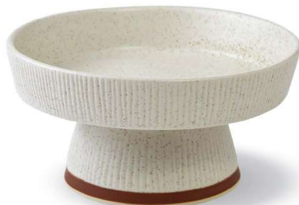
Pedestal Tray 2949 - Ø18.5 x H9.5 cm 550 ml