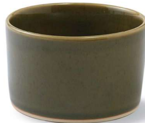
Jar 2625 - Ø12 x H7.5 cm 570 ml