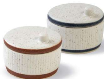
Bowl 2946 - Ø6.5 x H3.5 cm 50 ml Lid 2947 - Ø6.3 x H2 cm 50 ml