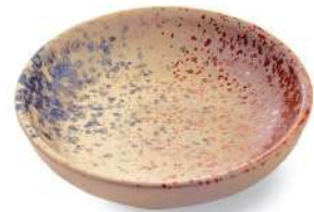
Dish 1473 - Ø10 x H2.5 cm 70 ml 1578 - Ø7 x H2 cm 35 ml