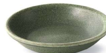
Bowl 028 - Ø18 x H4 cm 400 ml