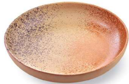
Deep Plate 2613 - Ø25 x H4.5 cm 1300 ml 2641 - Ø20 x H4 cm 700 ml