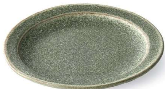
Plate 150 - Ø20 x H1.5 cm