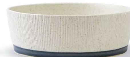
Bowl 2941 - Ø22 x H7.5 cm 1800 ml