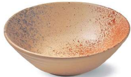
Bowl 2301 - Ø21 x H7 cm 1000 ml