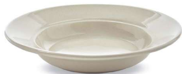
Plate 041 - Ø25 x H3.5 cm 400 ml