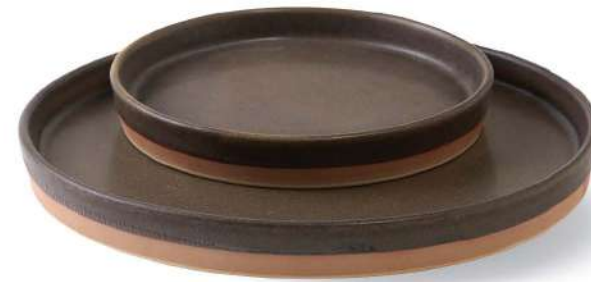
Plate 2732 - Ø17.5 x H3 cm 2751 - Ø25.5 x H3 cm