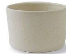
Jar 2625 - Ø12 x H7.5 cm 570 ml