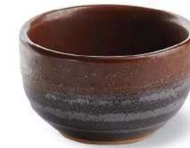
Sake Cup 2682 - Ø6.5 x H3.5 cm 50 ml