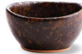
Dish 1539 - 7 x 8 x H4.5 cm 100 ml