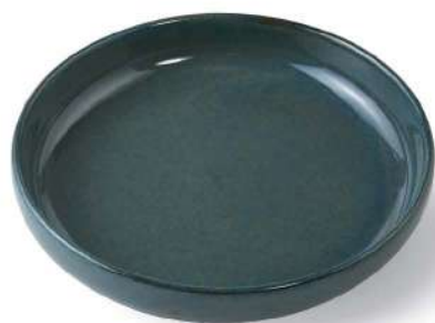
Plate 2420 - Ø20 x H4cm 700 ml