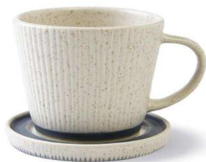
Coffee Cup 2951 - Ø9 x H7 cm 200 ml Saucer 2965 - Ø10 x H0.5 cm