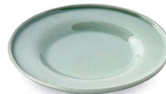
Plate 2714 - Ø23 x H3 cm