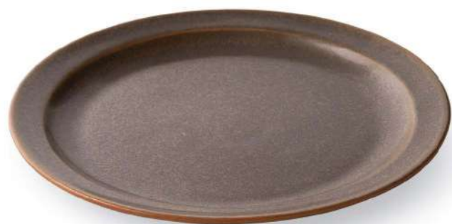
Plate 149 - Ø28 x H2.5 cm