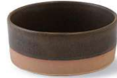
Jar 2628 - Ø12 x H5 cm 350 ml