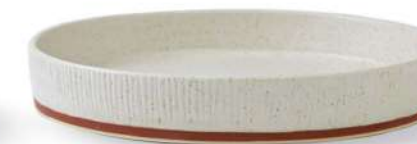
Plate 2939 - Ø17.5 x H3 cm 330 ml