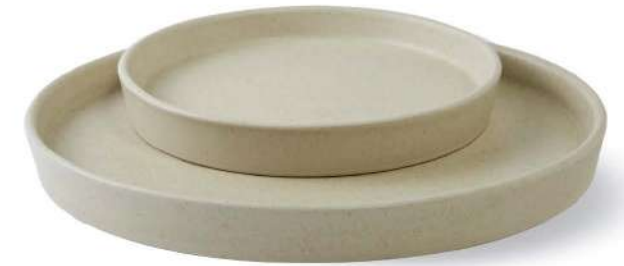
Plate 2732 - Ø17.5 x H3 cm 2751 - Ø25.5 x H3 cm