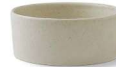
Jar 2628 - Ø12 x H5 cm 350 ml