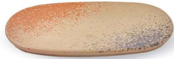
Oval Bowl 2648 - 23 x 14 x 1.5 cm