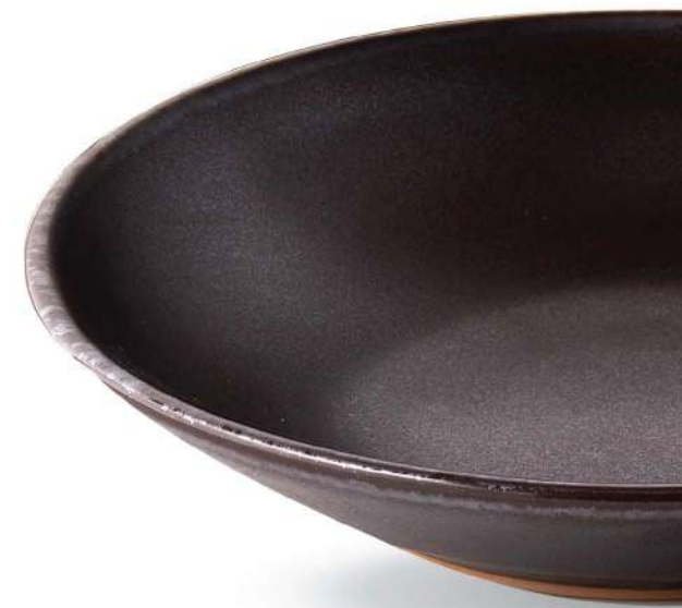
Coupe Plate 018 - Ø31 x H5.5 cm 019 - Ø25 x H5 cm 020 - Ø21 x H4 cm 021 - Ø17 x H3.5 cm