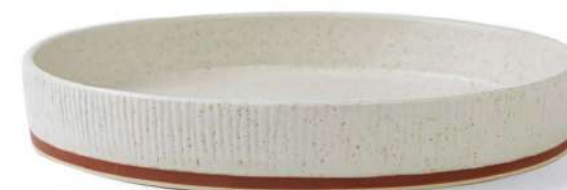
Plate 2938 - Ø22 x H3.5 cm 700 ml