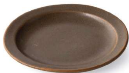
Plate 151 - Ø16 x H1.5 cm